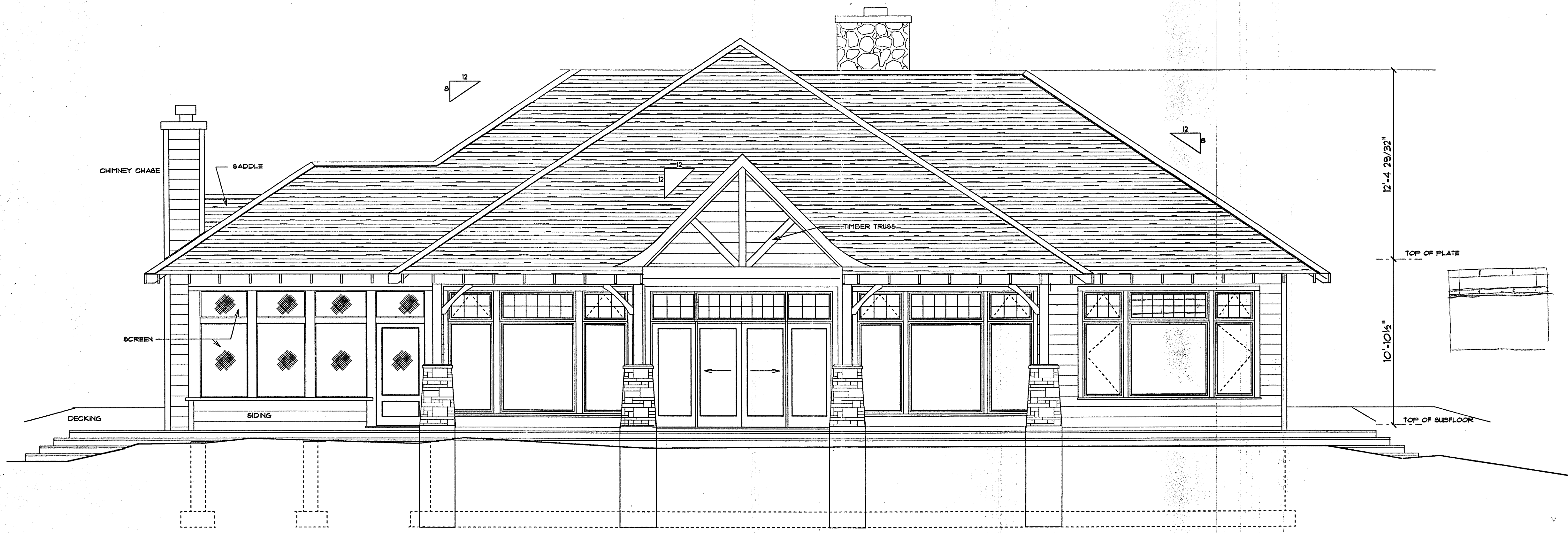
SOUTH ELEVATION (LAKESIDE)

ALL WORK TO CONFORM TO THE LATEST EDITION OF THE ONTARIO BUILDING CODE AND ACCORDING TO ALL OTHER BODIES HAVING JURISDICTION.